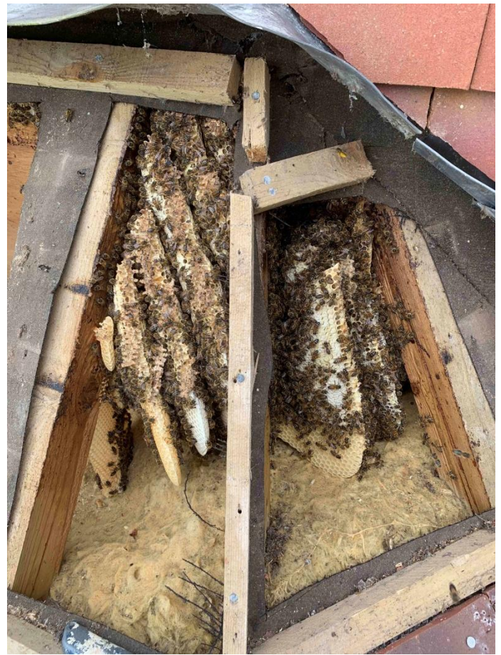
This is the RH corner of the roof showing this 2 nd colony still in residence.