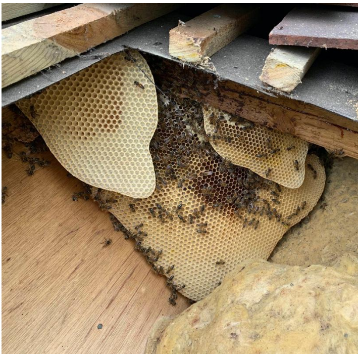
This is the 2 nd colony, at the RH end above the bay window.