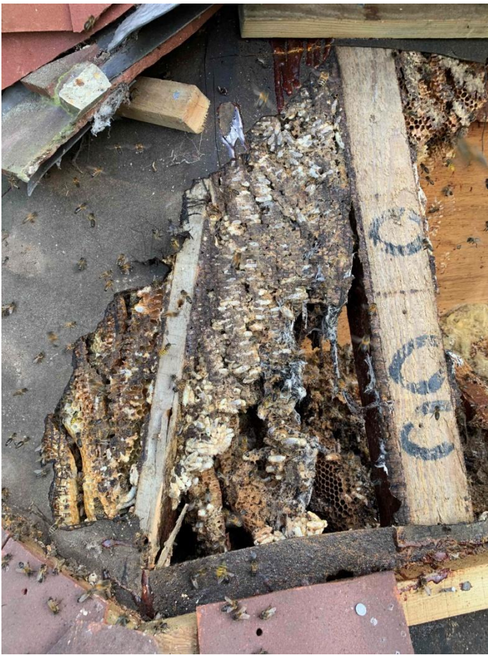
The 2 nd section of the brood nest exposed at the LH end above the bay window. We believed the colony had absconded as a prime swarm ~2 months' earlier due to extensive wax moth infestation now visible.