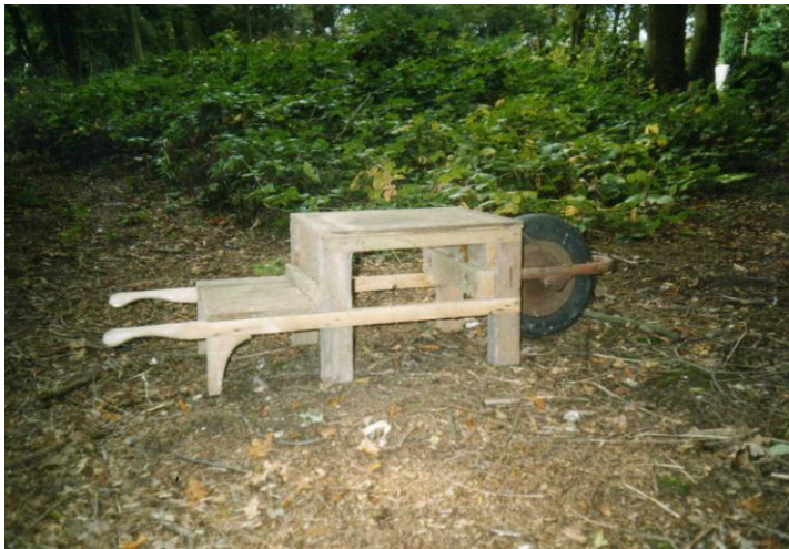
Mobile Step Ladder for removing supers etc....