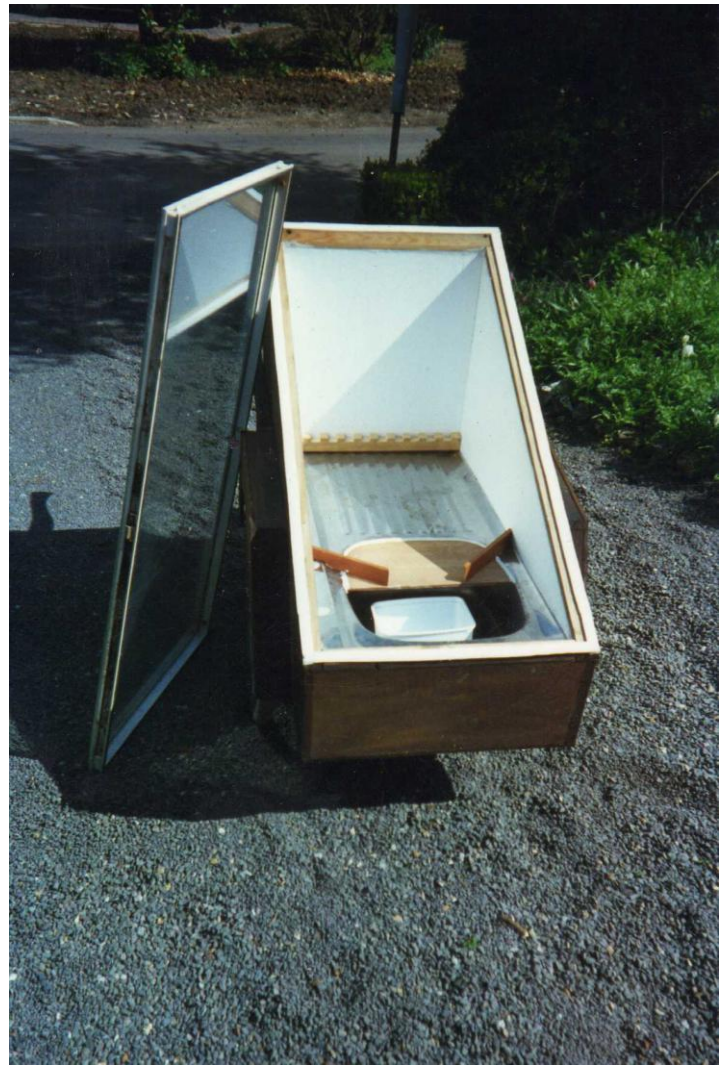
Conversion of SS Sink into a Solar Wax Extractor.