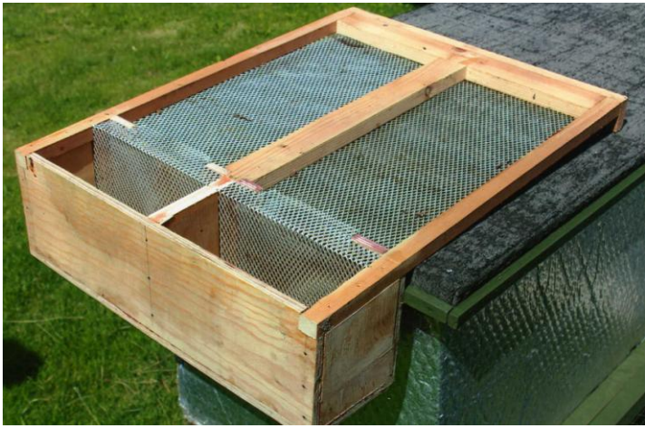
Open Mesh Floor with Feeder