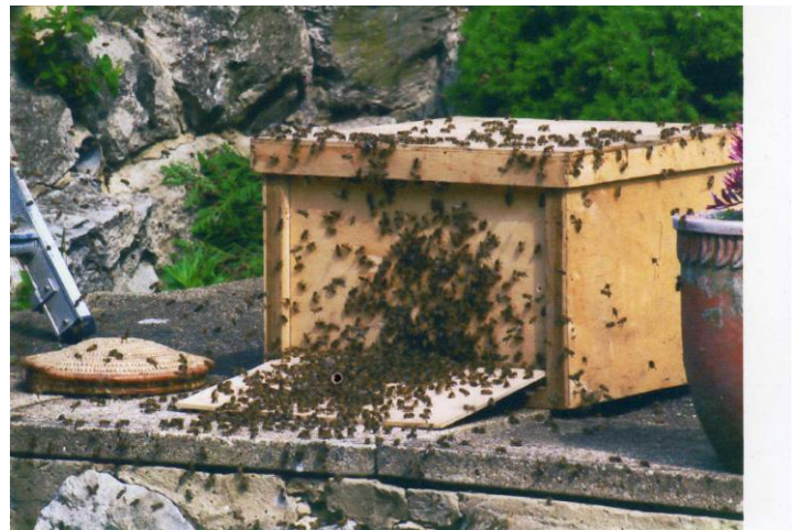
This Swarm Collection Box has a flap that can be raised to close the entrance for transportation. It could also be used as a bait hive.