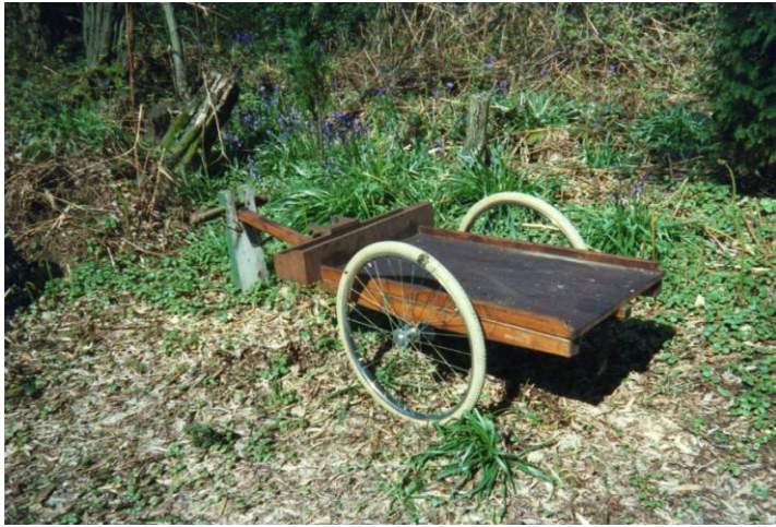
Transporter for Supers + box to carry smoker & other tools. Large wheels make it ideal transport over uneven ground.