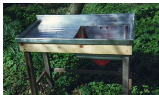
SS Sink Uncapping Tray + colander drain to bucket below.