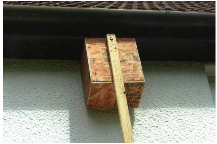
Swarm Catcher or Swarm Lure Box?