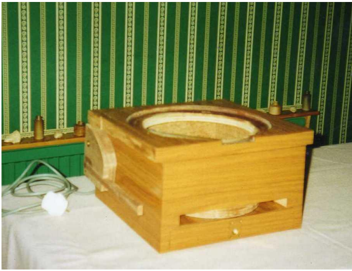
Tilting Honey Tank Stand + 60 watt Heater.