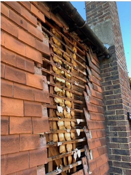
Tiling removed giving an overview of the entire honeycomb.