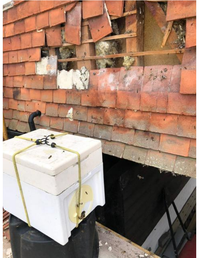
The poly nucleus was left till late evening to collect foraging bees as they returned to their original home.