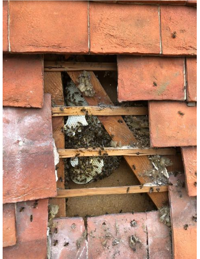
A close up exposes that this was a very Small Colony. The comb was then cut out and placed with bees into a poly nucleus.