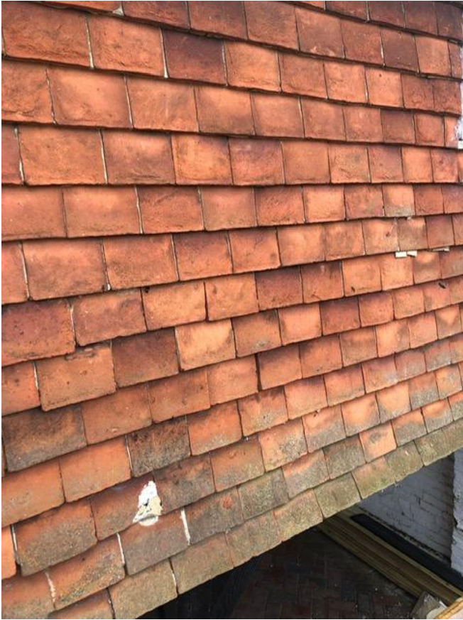
One solitary bee entering underneath tile cladding.