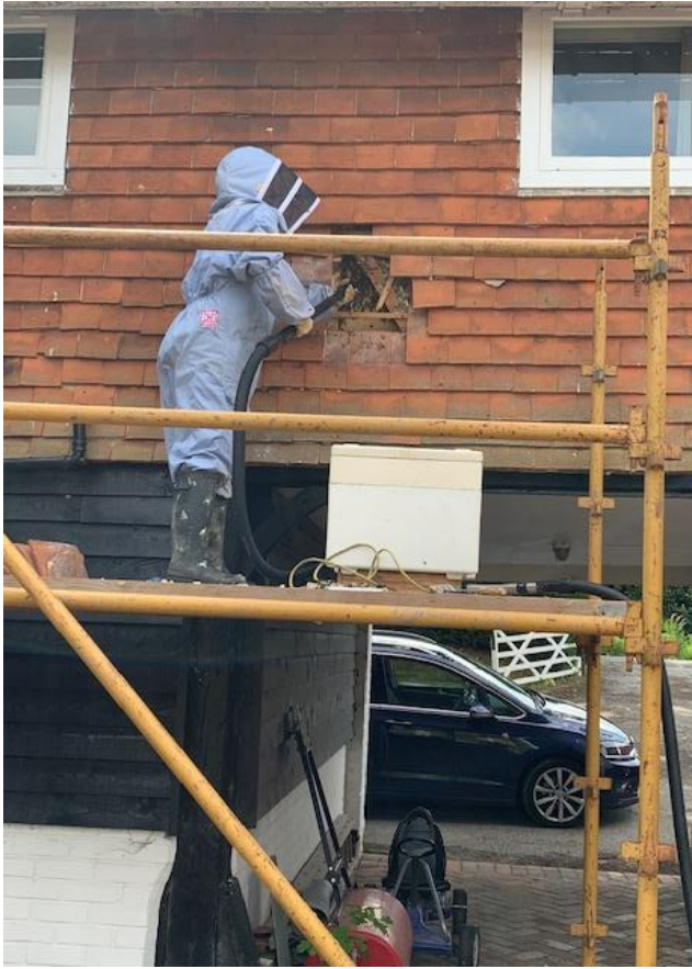
Vacuuming the few remaining bees into the poly nucleus.