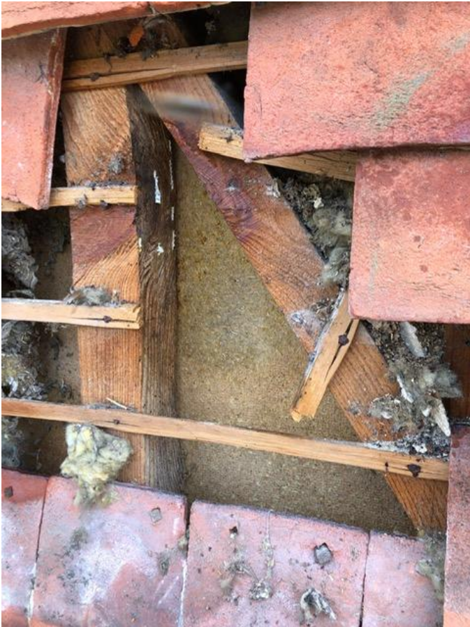
Bee removal complete. The quickest extraction ever, all completed in less than 2 hours!!!